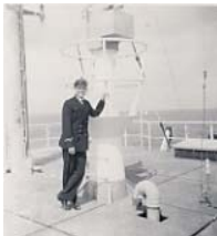
On the bridge roof of the Zenatia